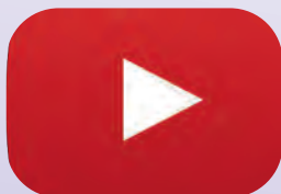
Glue 'n Glaze DAD55