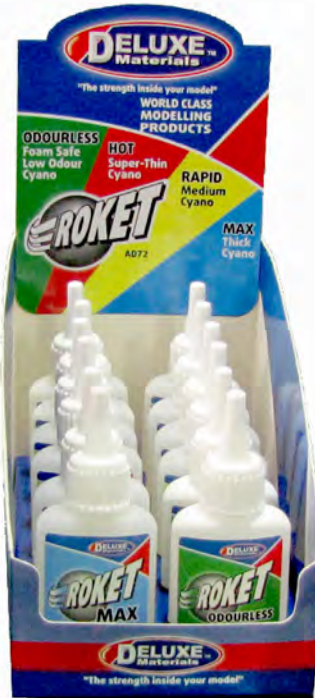
DAD72 Roket Glue Assortment Cyanoacrylate Adhesives 20g Sold By Set/12 Assorted