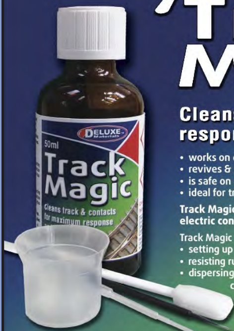
DAC13 Track Magic 50ml

Apply Track Magic using a soaked swab or supplied sponge or in tricky confined areas with the fine brush applicator supplied. Suitable for track cleaning vehicles.