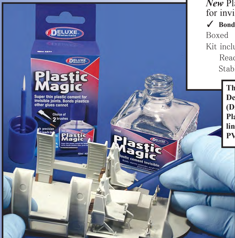
DAD77 Plastic Magic 40ml

The new safer formula can be applied with the Deluxe Materials Pin Flow solvent glue applicator (DAC11) or conventionally with a fine paint brush. Plastic Magic bonds nearly all commonly used modelling plastics including polyester, acrylic, styrene, ABS, PVC, butyrate, and polycarbonate.