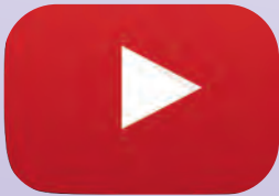
Scenic Snow DBD26, DBD29 & DBD25