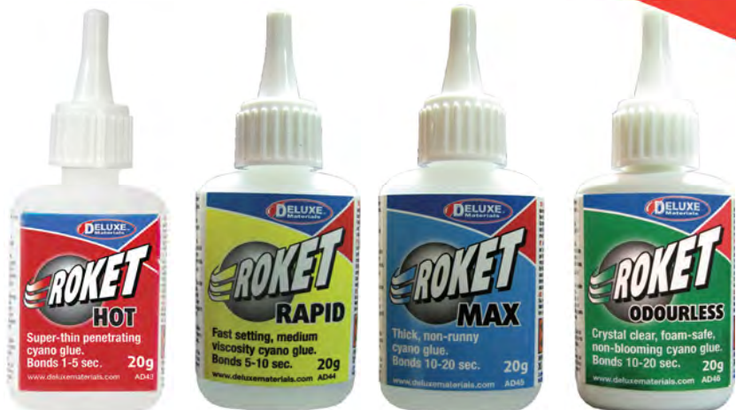
DAD43 Roket HOT Cyanoacrylate Adhesive 20g Sold By Each