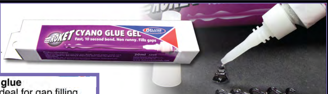
DAD69 Roket Cyano Glue Gel Cyanoacrylate Gel 20ml Sold By Each

A high strength cyano glue that does not run and is ideal for gap filling. Bonds: wood, plastic, metal, card, rubber etc. The metal tube extends shelf life.